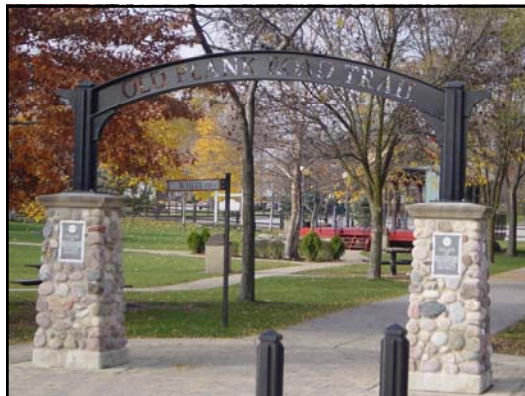
Old Plank Road Trail winds through downtown Frankfort