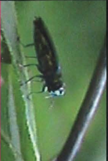
8. Adult borer