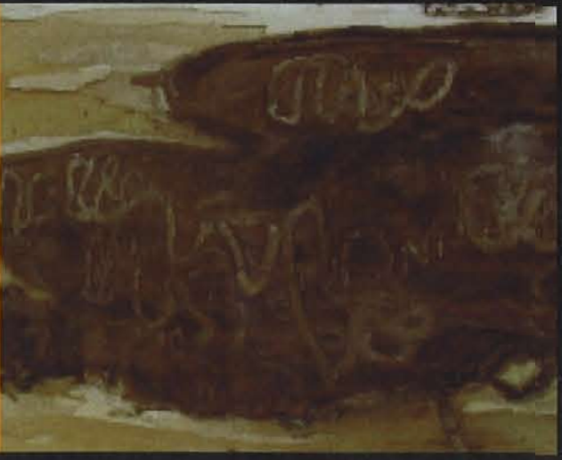
6. S shaped galleries