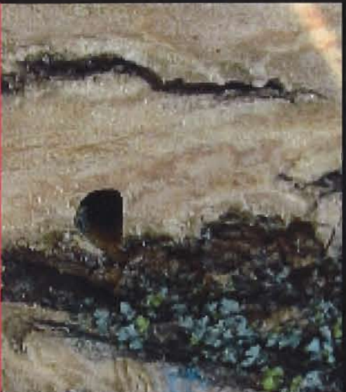
4. D-shaped exit holes