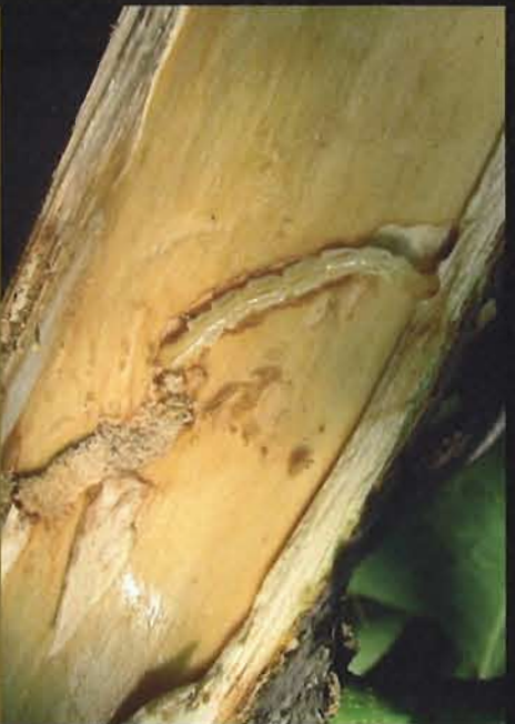
7. Larva with 10 bell shaped segments