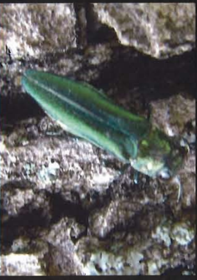
8. Adult borer