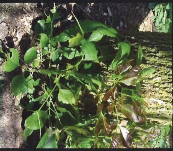
3. Basal Sprouting