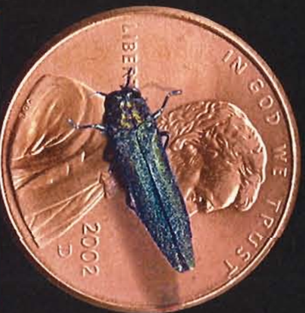
8. Adult borer