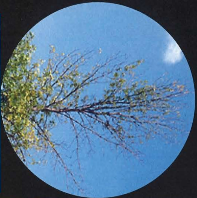
1. Dead and dying branches